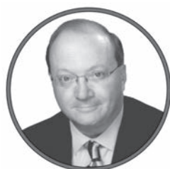
Hugh D. Segal, OC, OONT Kingston, ON, Canada