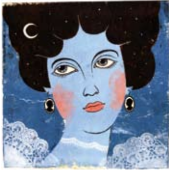
Program illustration for "Ring Round the Moon"

Celebrating its 10th Anniversary in 2008, Toronto's Soulpepper Theatre Company presents the world's finest theatrical classics with a distinctly Canadian perspective. This renowned repertory company also provides training for the next generation of theatre artists, and nurtures a